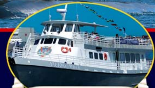
ABOARD THE VICTORY ROVER

The newest and fastest way to see the Norfolk Naval Base Departing from Nauticus, Home of the Battleship Wisconsin